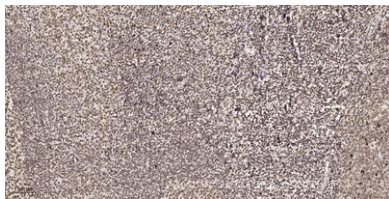
Immunohistochemical analysis of paraffin-embedded human tonsil. 1, Tris-EDTA, pH 9.0 was used for antigen retrieval. 2 Antibody was diluted at 1:200 (4° overnight). 3, Secondary antibody was diluted at 1:200 (room temperature, 45 min).